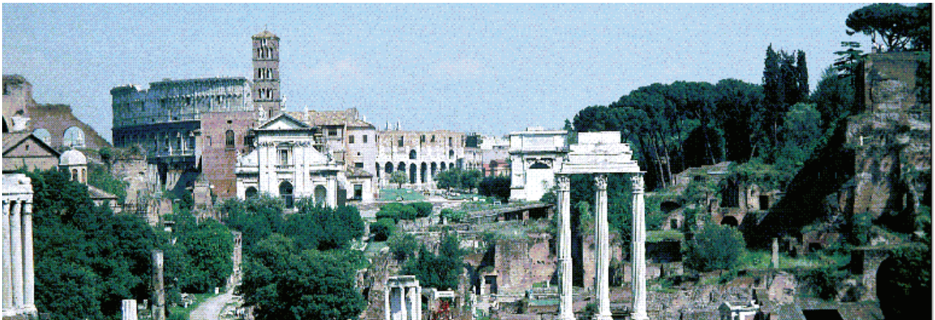
The Forum in Rome

The final chapters of The Acts of the Apostles all describe the experiences of the apostle Paul during his time as a prisoner of the Romans. Paul was a most important person in the outworking of God's purpose, his being the principal role in the proclamation of the gospel to the Gentiles. We might be inclined, therefore, to think that Jesus, being in control of events, would not permit Paul to remain in prison but would secure his release, as in the case of Peter (Acts 12:11). However, God has a variety of ways to fulfil his will and sometimes his ways are contrary to the expectations of men. In this case his purposes were achieved for Paul was taken to Rome, the Empire's capital, where the gospel was proclaimed, not only to Jews and Gentiles but also to the highest authorities.