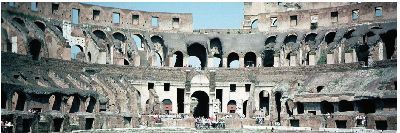
The Coliseum in Rome

You will notice that he addresses the disciples as “saints” 1:7. This title means “separated” or “sanctified”, and all the people of God are called saints. In later times men began to award the title “saint” to those, usually dead, whom they considered worthy of it, such as Paul himself. However, Paul is never referred to in the scriptures as “St. Paul”, although he is a certainly a saint, as are all the true disciples of Christ because they are all “separated unto the gospel of God” 1:1.